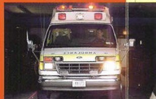
EMS Volunteers perform a variety of duties. From driving the ambulances to answering phones, administering emergency care, to filling forms, volunteers wear many hats.